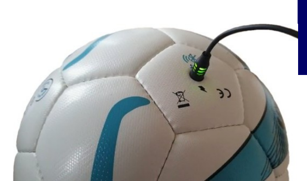
AIRTLS magnet-USB connector, charge cable included 500mAh LiPo battery